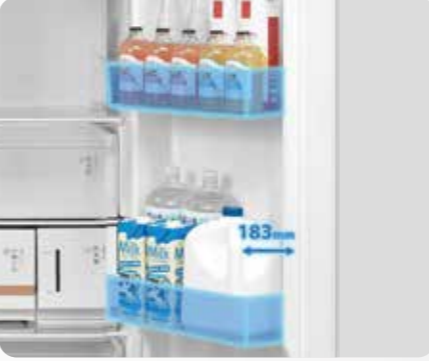
XXL Bottle Rack