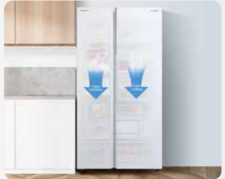
Super Cooling & Super Freezing